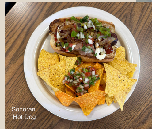
Sonoran Hot Dog